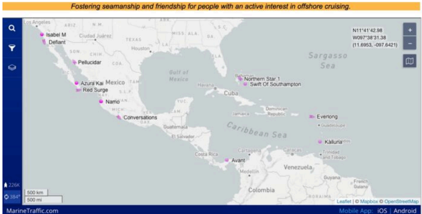
A portion of the BCA Fleet Map as of January 2022

And just to remind everyone, the Board recently announced the addition of a new custom field for a boat's MMSI number which will be included in the Directory. Please remember to add your boat's MMSI when you update its profile.